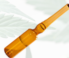
Cannabinoid/ Terpene Standards