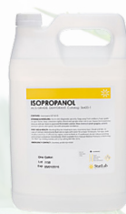
Isopropyl Alcohol HPLC & LCMS Grade