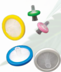
Syringes and Filters