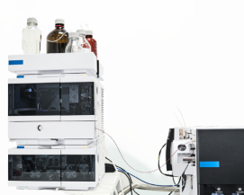
HPLC, LC/MS, GC