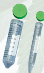
Tubes, Vials, and Caps