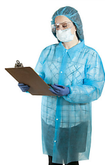
PPE/Safety (gloves, coats, etc.)