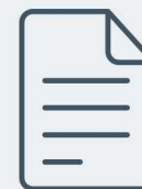
Supplied with a Certificate of Analysis