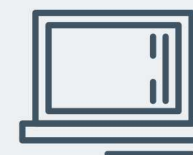
Analytical Standards for ICP and ICP-MS Analysis