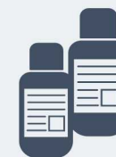
Inorganic Certified Reference Materials

Claritas PPT® Grade Certified Reference Materials are designed for ICP-MS and can also be used in ICP analysis. Our comprehensive line of 10 µg/mL (10 ppm) standards have an accuracy within 2% of uncertainty. Standards are packaged in 30 mL and 125 mL bottles to minimize contamination. They are made using ultra-high purity acids, the highest grade starting materials and ASTM Type I Water to minimize contaminants.